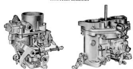
Type 30 (30/30) (Overhead) Carburetor; Type 40 (40/40) (Overhead) Carburetor